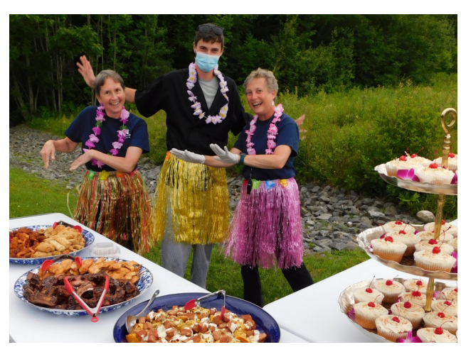
Tiki Party for New Gazebo

Our chefs out did themselves with a scrumptious buffet of ribs, coconut shrimp, egg rolls, spam & pineapple and pina colada cupcakes to celebrate the completion of the new gazebo.