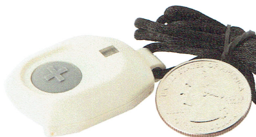
Actual Size of Pendant (1-¼ inch long, 1 inch wide)