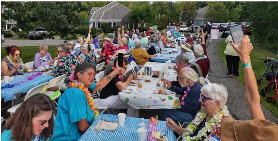
A good time was had by all at the 27 th Anniversary Penobscot Shores Street Party