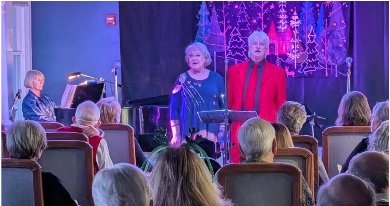
Best Christmas Concert Ever